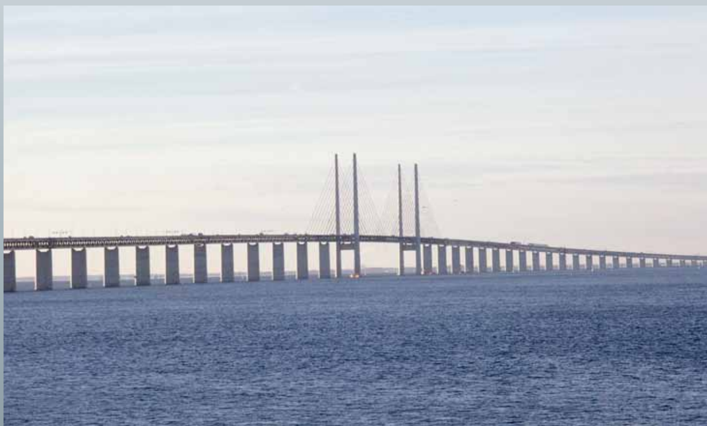
The Öresund Bridge