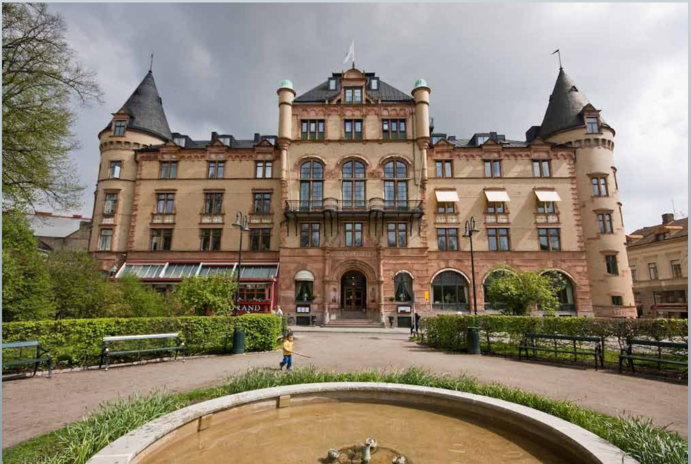
The Grand Hotel, Lund

19.30 Conference dinner at the Grand Hotel in Lund