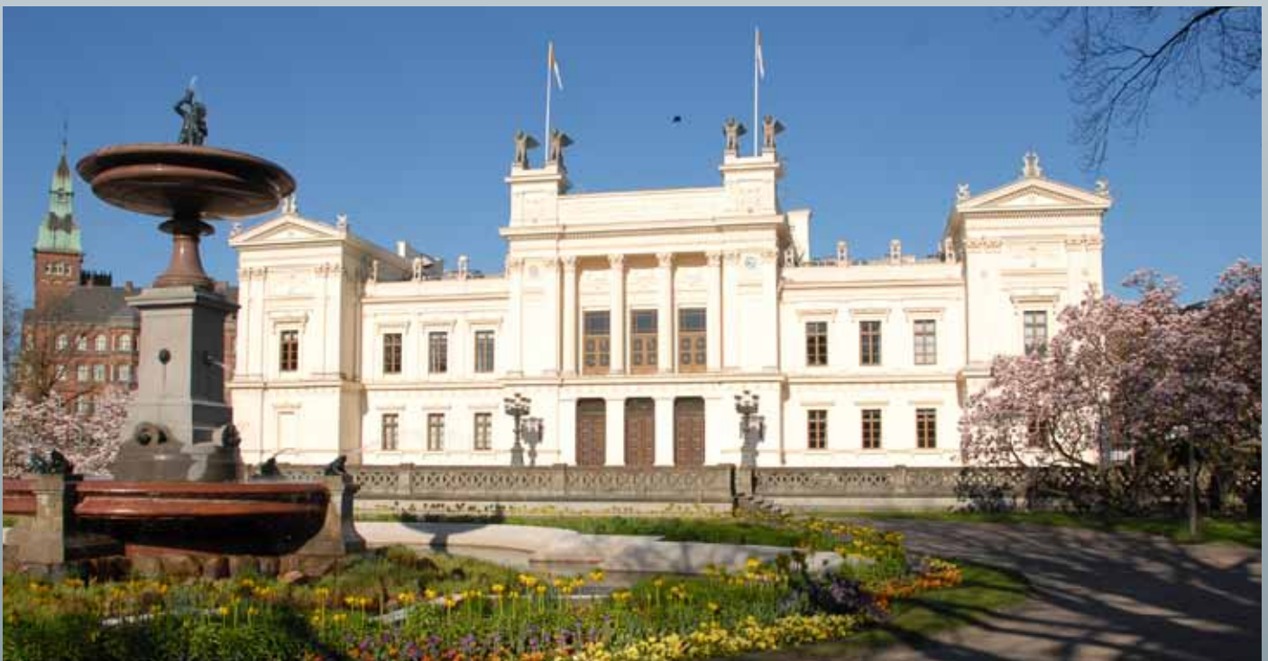
Lund University Main Building